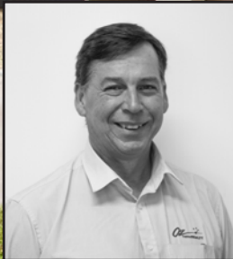
Sold by Robert Zuzic

Bayswood Estate properties in hot demand