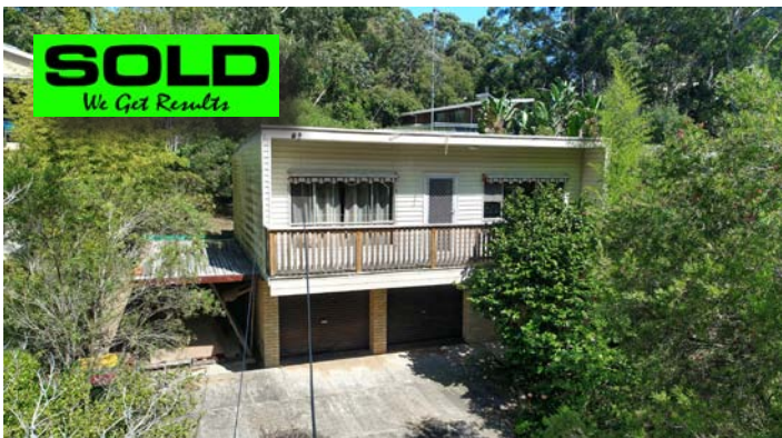
391 Elizabeth Drive, Vincentia