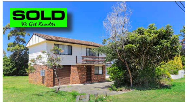
14 Dacres Street, Vincentia